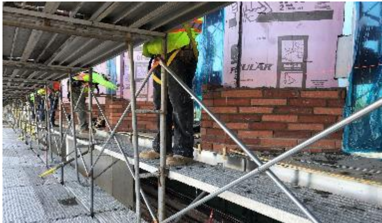
Masonry at West Elevation