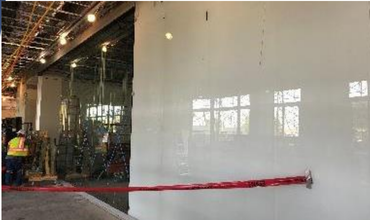
1 st Floor 14' Tall Glass Installation