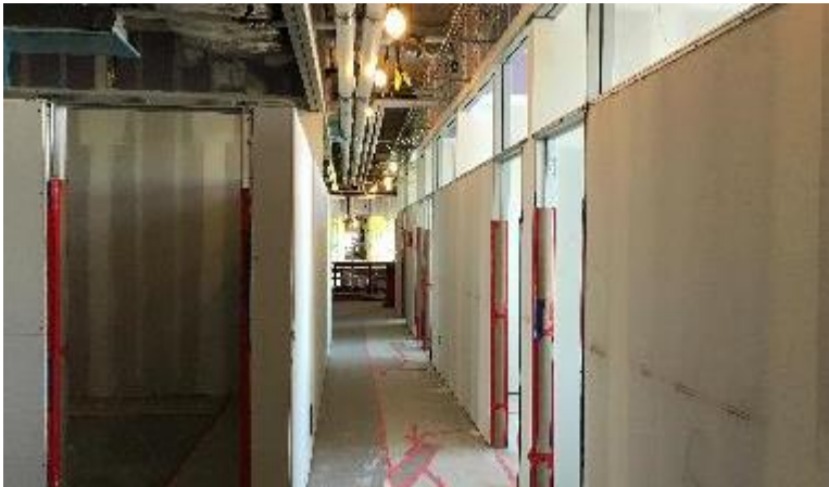
2 nd Floor Aluminum Glazing Frames