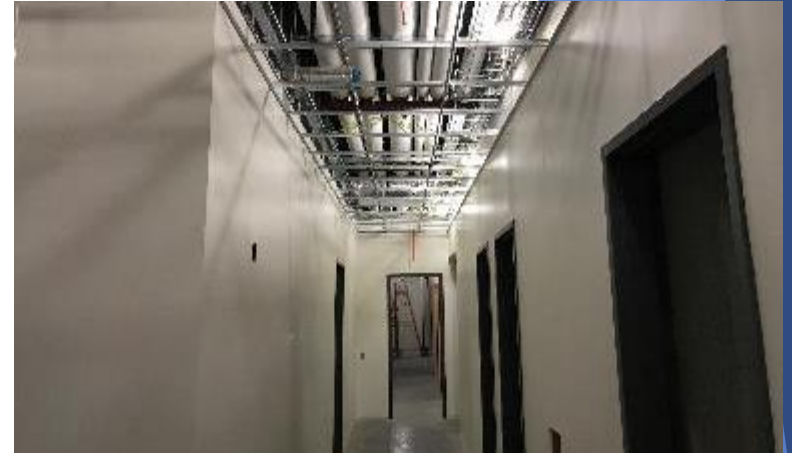
Ceiling Grid in Basement Corridors