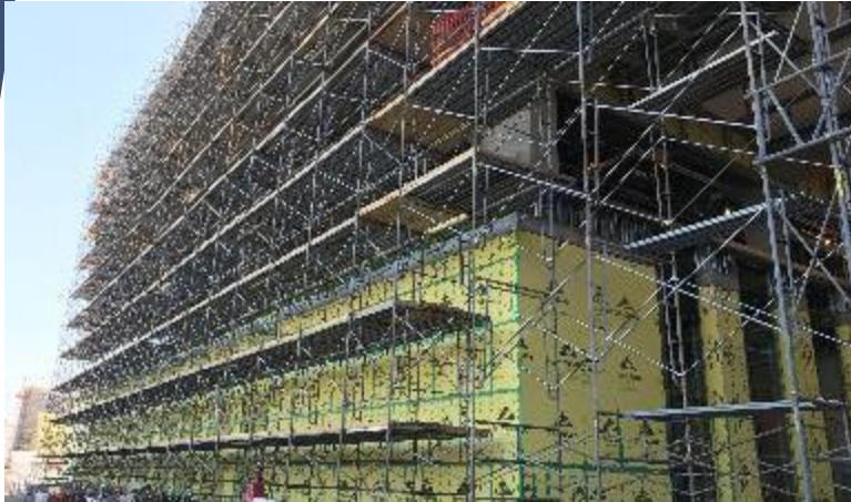
Scaffolding on Northwest Building Elevation