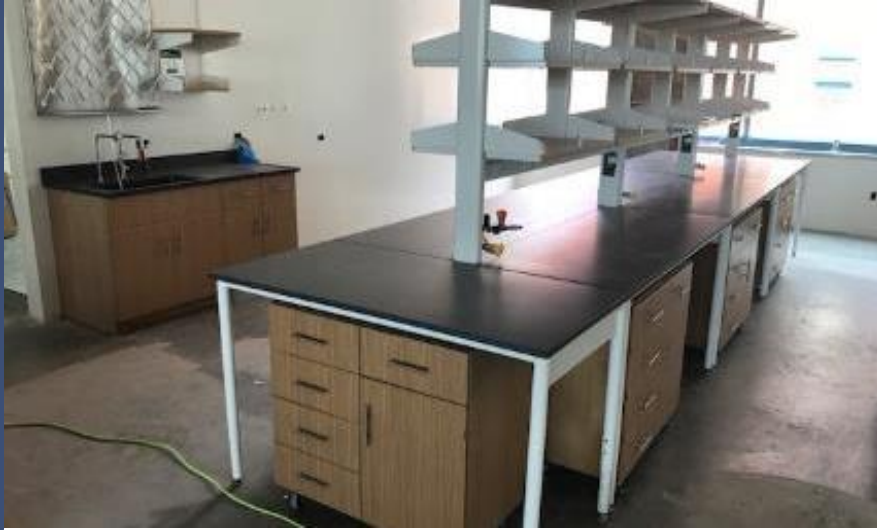
Laboratory Casework Mockup (Current)