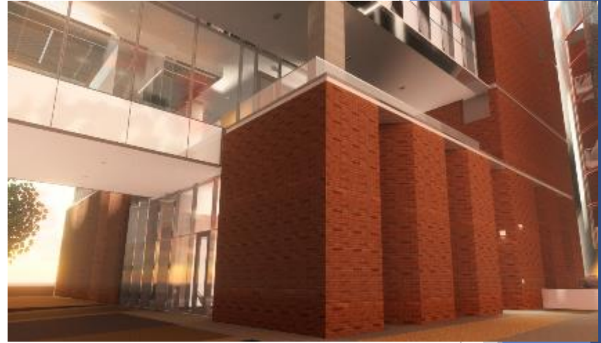
Interaction Bridge Masonry East Elevation (3D Model)