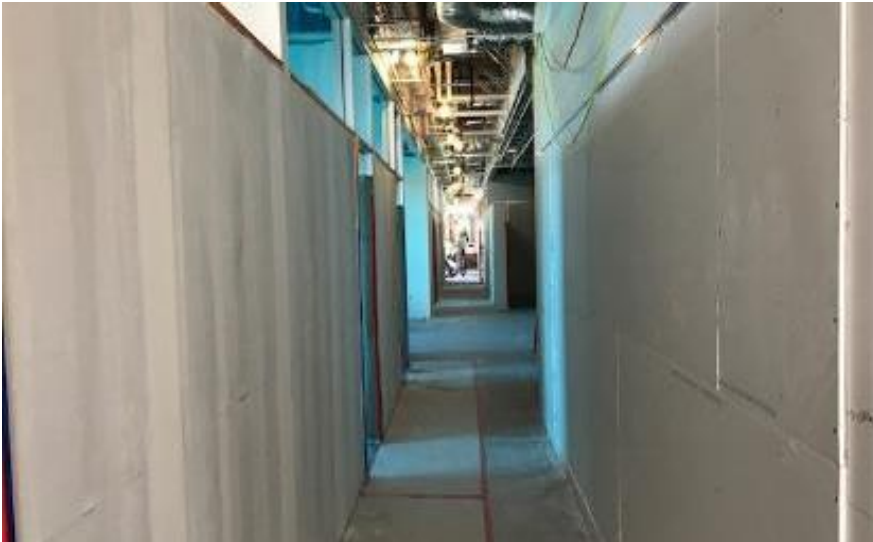
2 nd Floor South Corridor (Current)