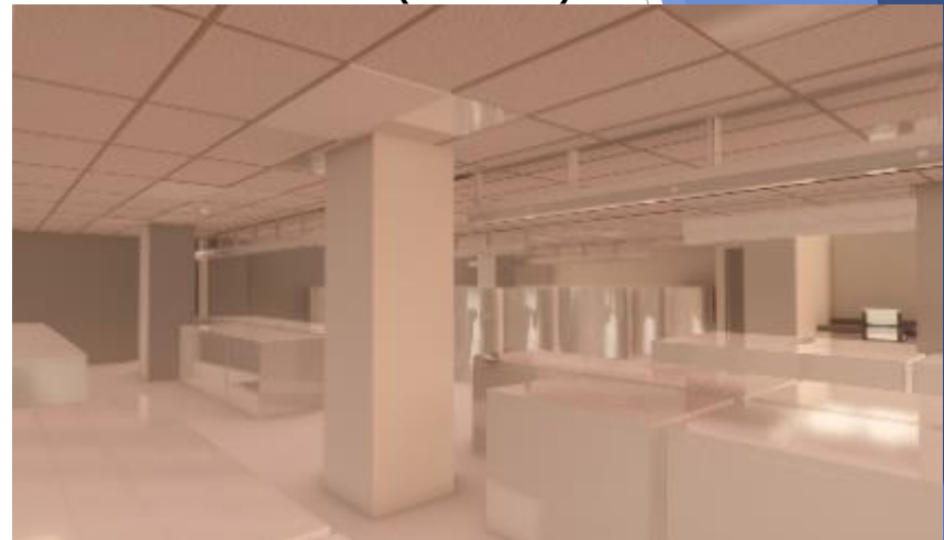
Refrigeration Space (3D Model)