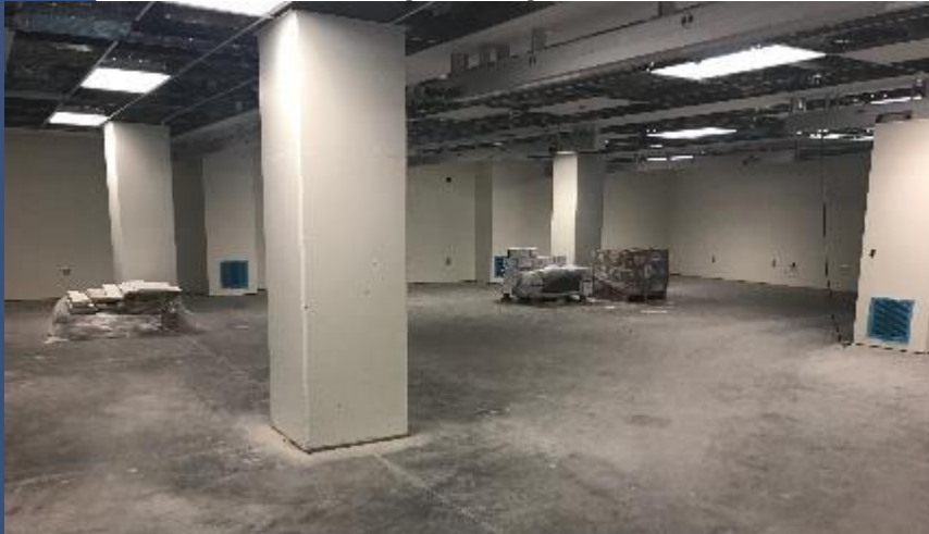
Refrigeration Space (Current)