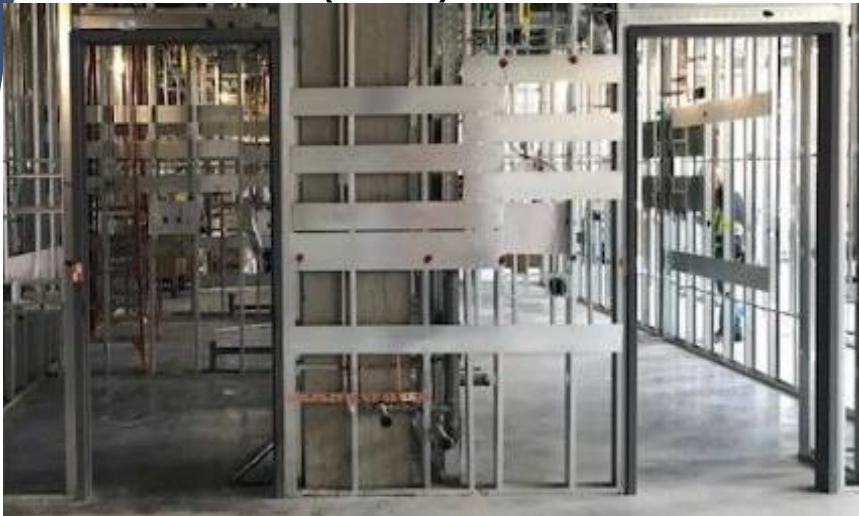
3 rd Floor Wet Laboratory Wall (Current)