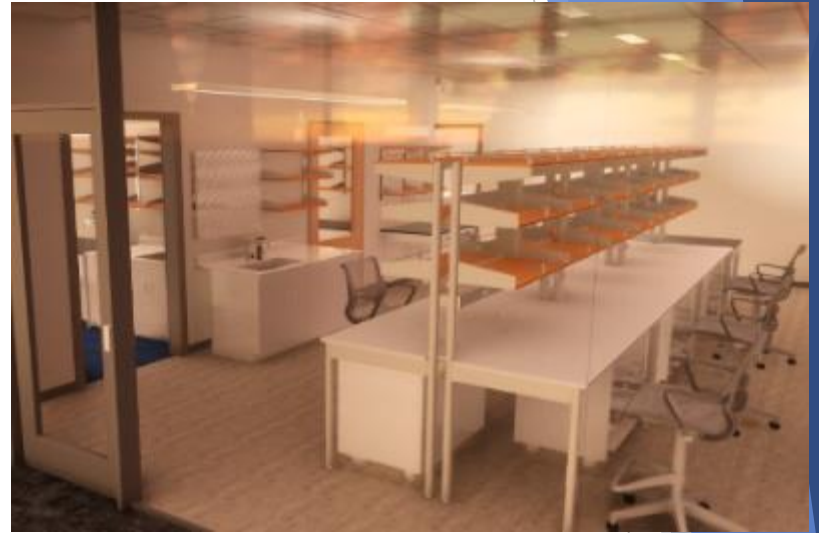
Laboratory Casework Mockup (3D Model)