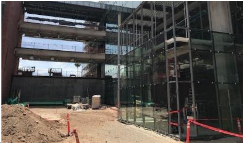
Café and Courtyard Exterior Glazing (Current)