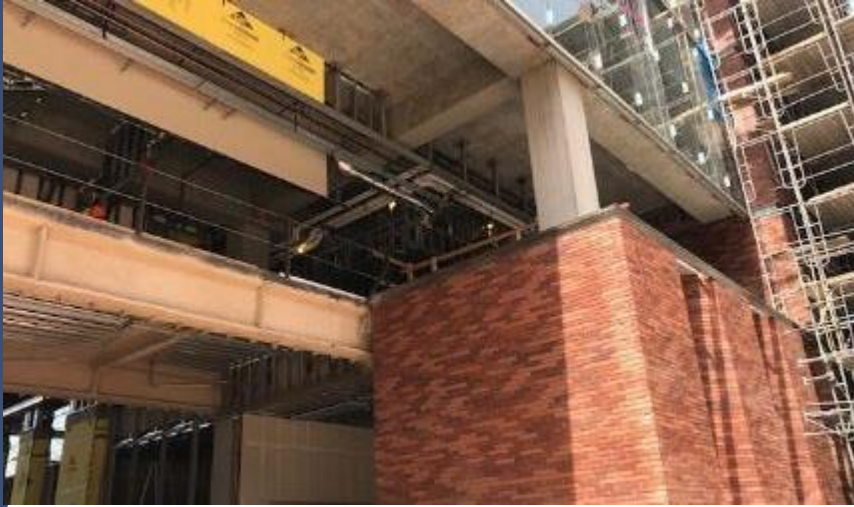
Interaction Bridge Masonry East Elevation (Current)